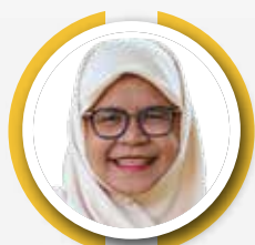
Dato' Seri TPr (DR.) Maimunah Mohd Sharif Mayor of Kuala Lumpur, Malaysia