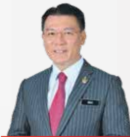
YB Tuan Nga Kor Ming Minister of Housing and Local Government, Malaysia and President of the UN-Habitat Assembly

A thought-provoking opening session delivered by a distinguished leader, focusing on global trends and challenges in the wake of geoeconomic uncertainties. What can ASEAN collectively do in solutioning the on-going housing trilemma? The keynote will emphasise bolder approaches to advance sustainable development, inclusivity, and the future of living environments in rapidly urbanising societies.